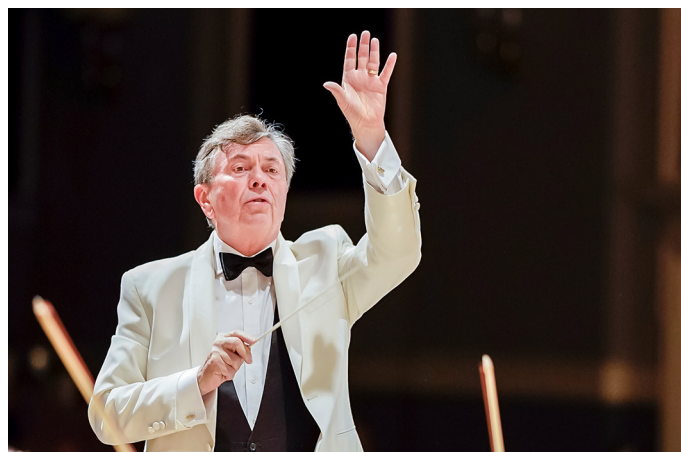
Gerard Schwarz, Music Director | Alan G. Benaroya Music Director's Chair

On behalf of EMF's board, faculty, staff, and young artists, welcome to the 2023 Season of Eastern Music Festival. Our 62nd Season brings an array of familiar masterworks as well as pieces by composers who are new to us all! We delight in welcoming 265+ young artists, a festival faculty of more than 60 world renowned artists, and special guest artists including Gil Shaham, Hélène Grimaud, and Awadagin Pratt. Join us for more than 50 concerts over 36 days in our five-week celebration of musical excellence.